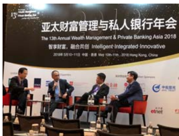
The 13 th Annual Wealth Management & Private Banking Asia 2018 Discussion Panelist