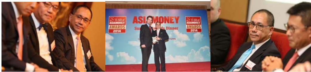
Hubbis 2016 Wealth THINK Discussion Panelist AsiaMoney 2014 Private Banking Award Ceremony Hubbis 2016 China Wealth Management Forum Discussion Panelist